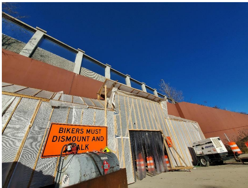
A view of the I-81 bridge over Chenango Street on January 4, 2022.

The state Department of Transportation had expected the street to reopen in December but that didn't happen. Pedestrians and bicyclists are able to use the street as construction work continues.