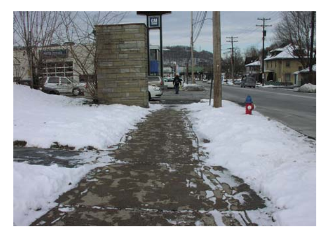
Deteriorated sidewalk north of the Bridgewater Center for Rehabilitation and Nursing to Gerard Avenue