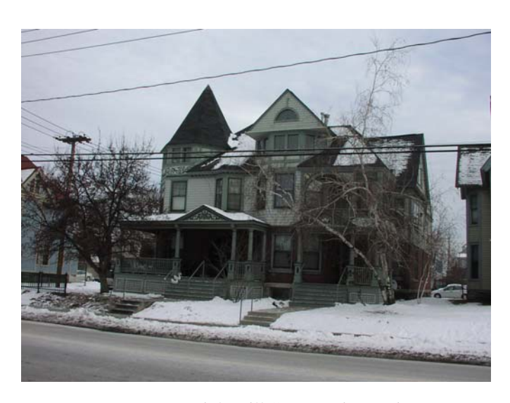
"New Dwightsville" renovation project

"New Dwightsville" is an exception along this segment of Front Street. In 2001, First Ward Action Council completed its "New Dwightsville" renovation project that transformed eight large deteriorated Victorian-style homes into 22 apartments for low and moderate-income families, preserving the history and character of the neighborhood. In 2007, First Ward Action Council was awarded $400,000 for the renovation of four more homes along this section of Front Street.