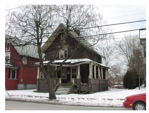
Dilapidated homes located on Front Street between McDonald Ave and Gaines Street

"New Dwightsville" is an exception along this segment of Front Street. In 2001, First Ward Action Council completed its "New Dwightsville" renovation project that transformed eight large deteriorated Victorian-style homes into 22 apartments for low and moderate-income families, preserving the history and character of the neighborhood. In 2007, First Ward Action Council was awarded $400,000 for the renovation of four more homes along this section of Front Street.