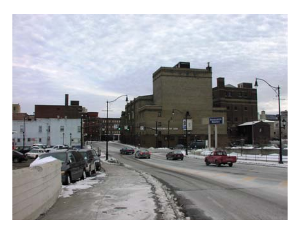
Intersection of Clinton Street and Water Street