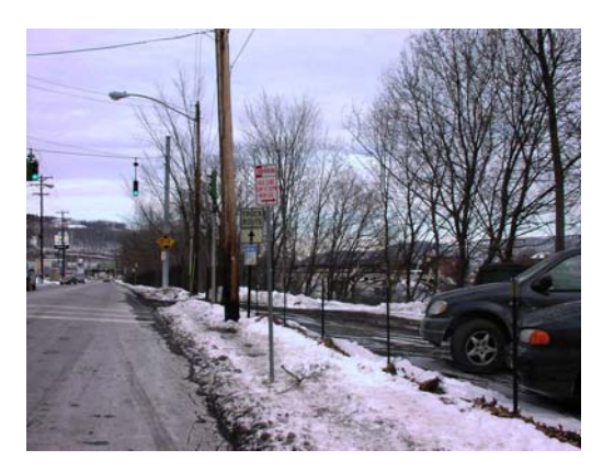
Existing bus stop – Intersection of Front Street and North Street

Many people come to downtown Binghamton every day using this gateway. It is an important gateway to the City and should be improved over time so that it becomes a welcoming and inviting entryway into the City. Land use along Front Street can be influenced by transportation investment. This investment should be used to accommodate and facilitate the chosen long-term vision for Front Street.