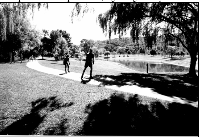
Rollerbladers at Otsiningo Park

It is not the role of BMTS to be an advocate, but rather, as with all the modes make the metropolitan that up transportation system, to use the planning process to balance investment in the transportation system that benefits the safe travel of all users and is responsive to the community's stated goals. As implementation proceeds, it is important that BMTS continue to explore funding opportunities for constructing successive trail segments.