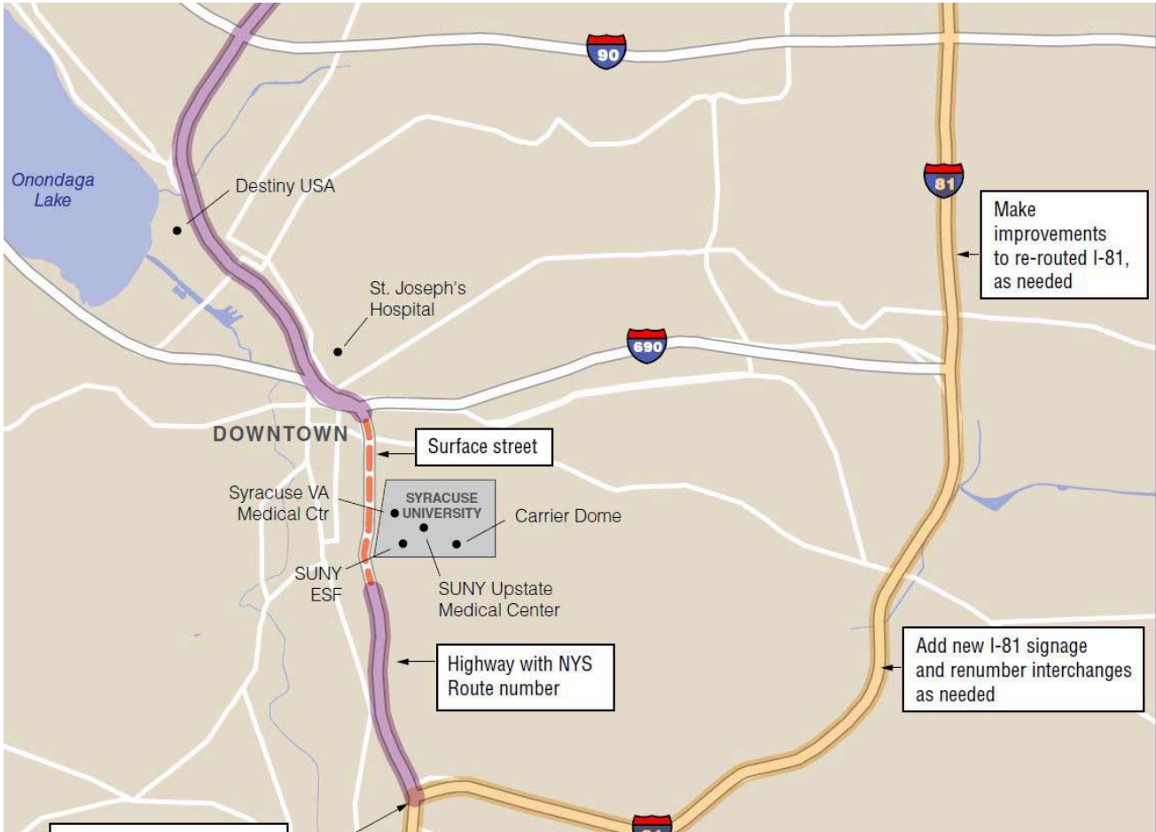
A map of the rerouting of I-81 around the city, and the section where the viaduct will be replaced by a grid.

Gov. Kathy Hochul, who supports the project, praised the court’s decision on social media.