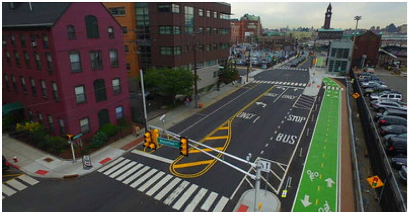
Raised curbs and bus and bike lanes have all contributed to traffic safety.