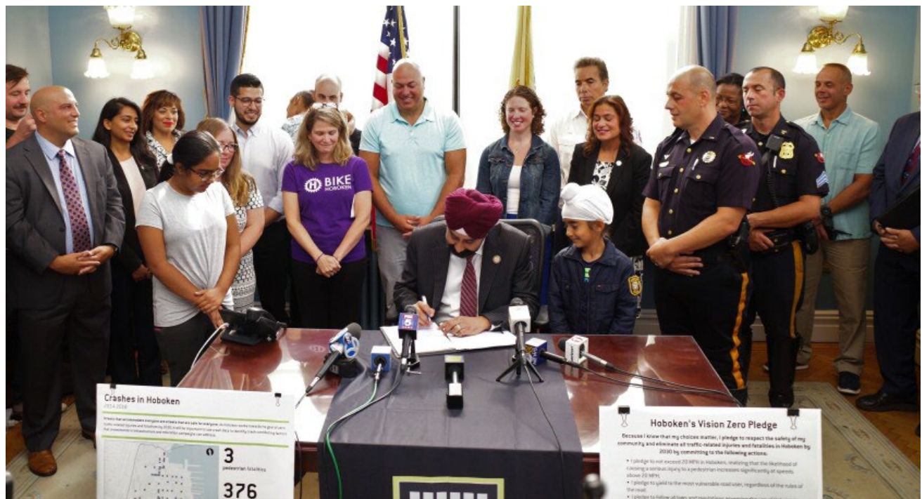
Mayor Bhalla signing the executive order establishing Hoboken's Vision Zero plan in 2019.

The administration's Vision Zero work still sometimes creates controversies. But on the whole, street redesigns have become normalized, Zimmer says. "The Hoboken public now understands and demands pedestrian safety, and rather than have to spend political capital, as I did," she says, "Mayor Bhalla actually earns political capital by continuing to move forward with pedestrian and bike safety."