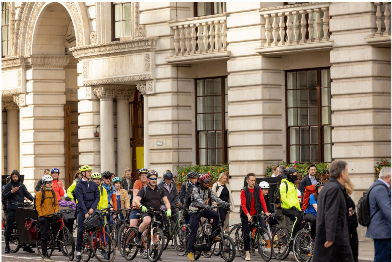
Come springtime in May, London's streets fill with commuters on bikes.

Norman knows these gaps put the city's growing numbers of riders at risk. "While we have seen an increase in cycling, we have seen a risk of collisions go down but only where there is cycle infrastructure," he says. Where there isn't the infrastructure, risks have increased because more people are riding where there aren't cycle lanes, he says.